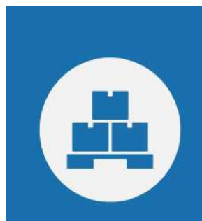
Put into the box / carton