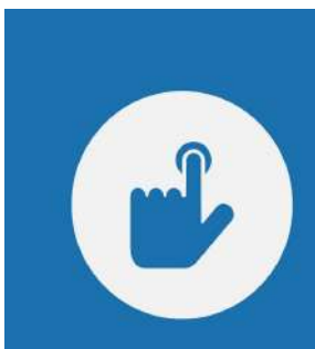
Press the button to start