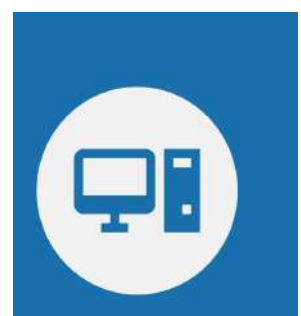
Connect PC to get PDF Report & CSV file